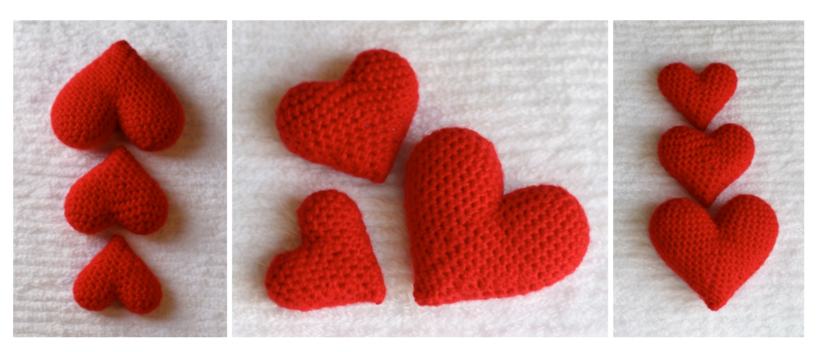
This work is licensed under the Creative Commons Attribution-Noncommercial-No Derivative Works 3.0 License To view a copy of this license, please visit <a href="http://creativecommons.org/licenses/by-nc-nd/3.0/">http://creativecommons.org/licenses/by-nc-nd/3.0/</a>; or, (b) send a letter to Creative Commons, 543 Howard Street, 5th Floor, San Francisco, California, 94105, USA. - Essentially meaning please don't share/reproduce/sell this pattern, or dolls made from this pattern. Feel free to make as many as you'd like for yourself or to give as gifts, but please respect my request as the designer. Thanks!